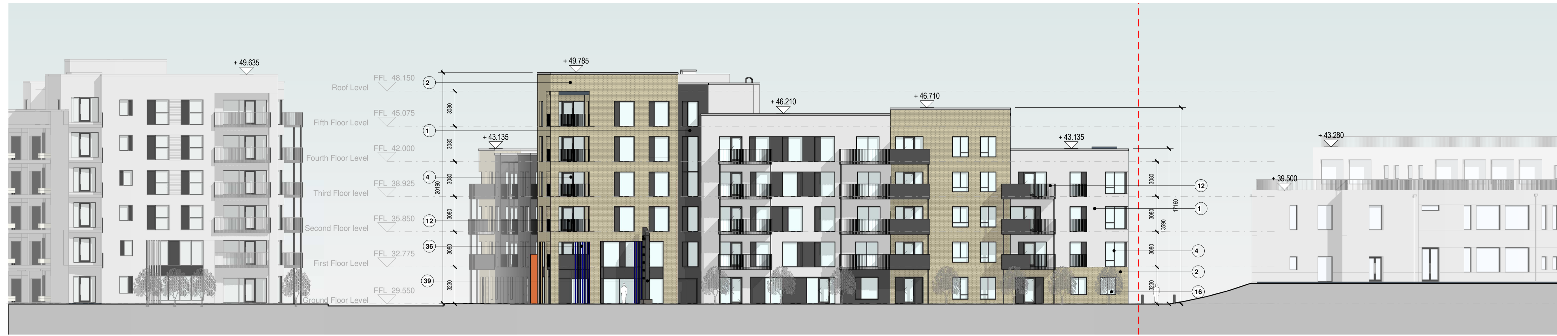
3 BLOCK F - EAST FACADE ALONG GORT NA BRO 1 : 200