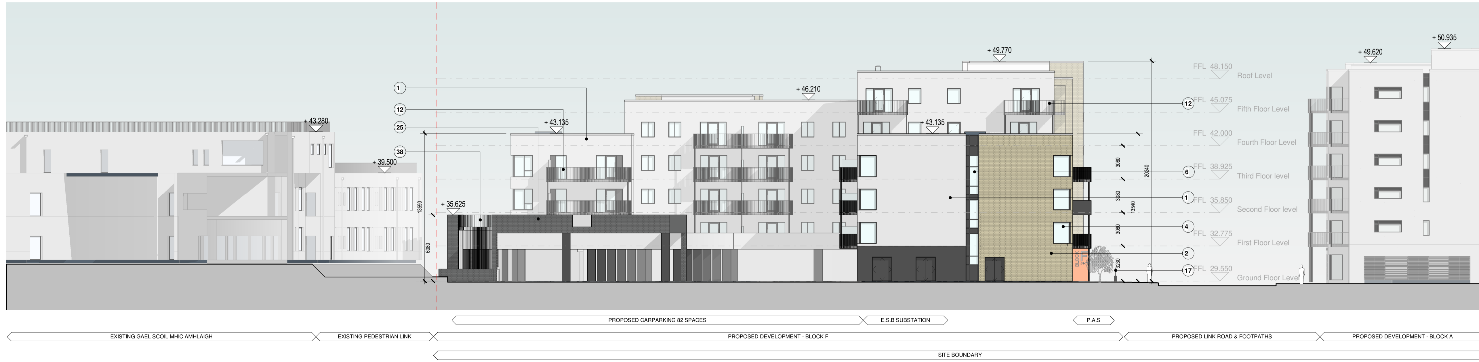
4 BLOCK F - WEST FACADE 1 : 200